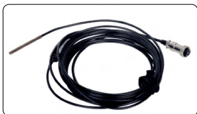
platinum resistance PT100 (optional)