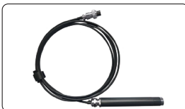
atmospheric pressure sensor (optional)