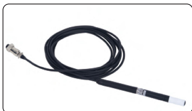
humidity sensor (optional)